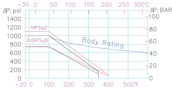
PTFE/R.PTFE Ball SEAT Pressure-Temperature RATING